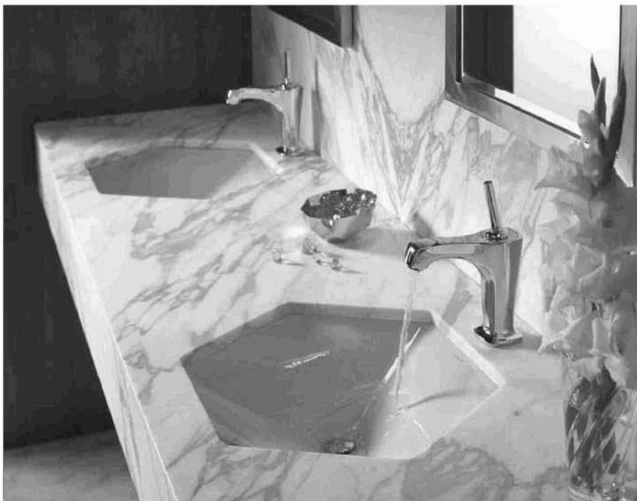
Simple upgrades can transform the bathroom into a luxurious space you want for yourself and your guests.